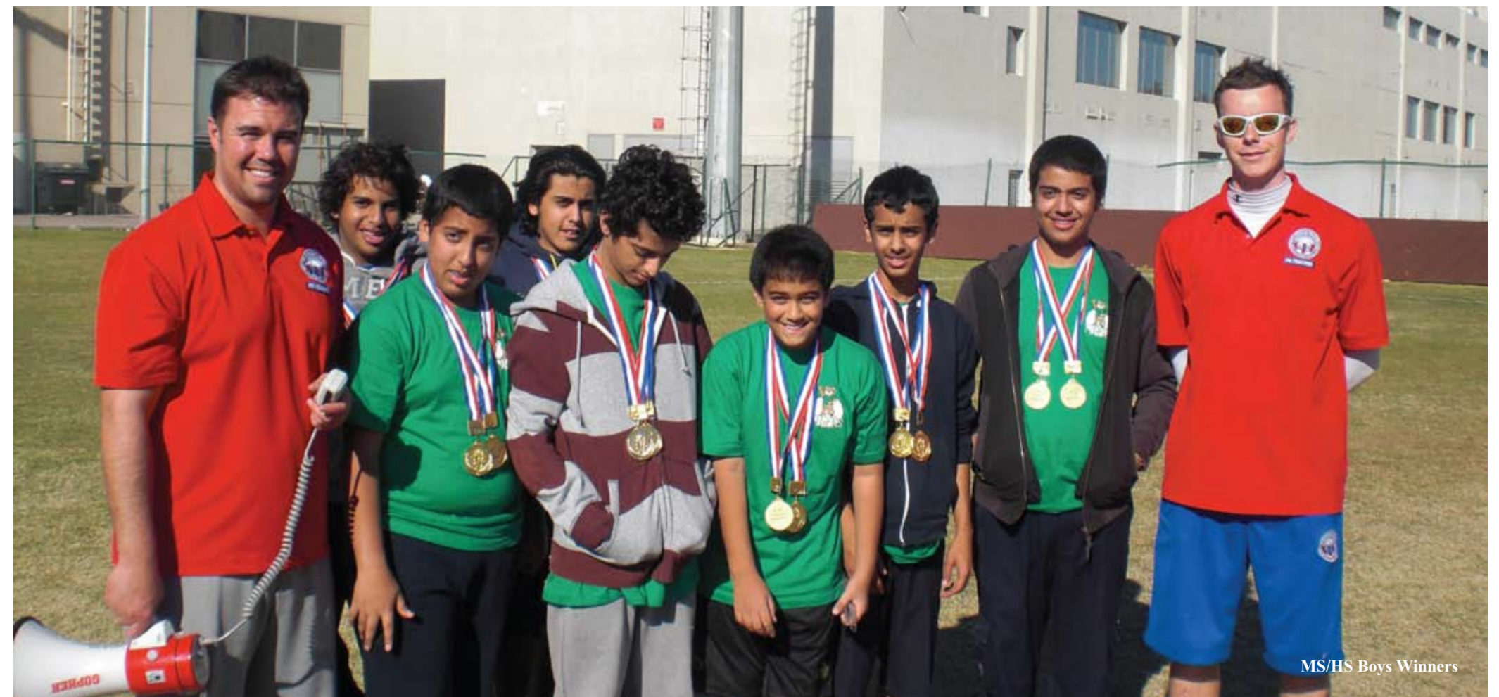
MS/HS Boys Winners