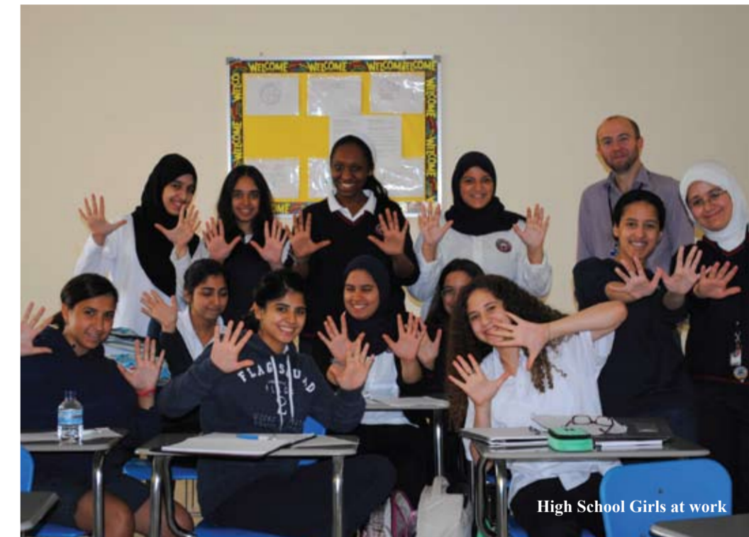
High School Girls at work