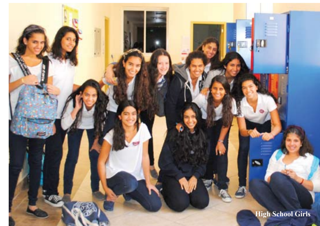
High School Girls