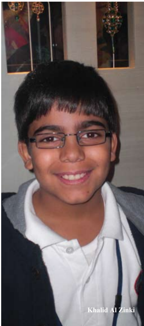
Khalid Al Zinki